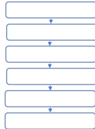
Figure 3. 1 Research Flowchart